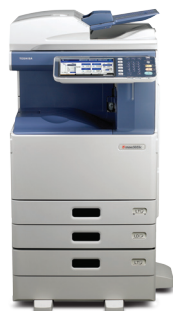
e-STUDIO5055c with Paper Feed Pedestal.