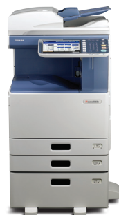
e-STUDIO5055c with Large Capacity Feeder.