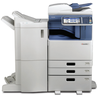
e-STUDIO5055c with Saddle-Stitch Finisher.